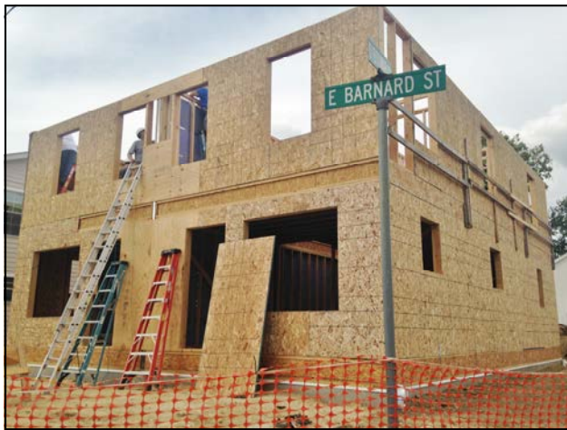
Framing the second floor in West Chester