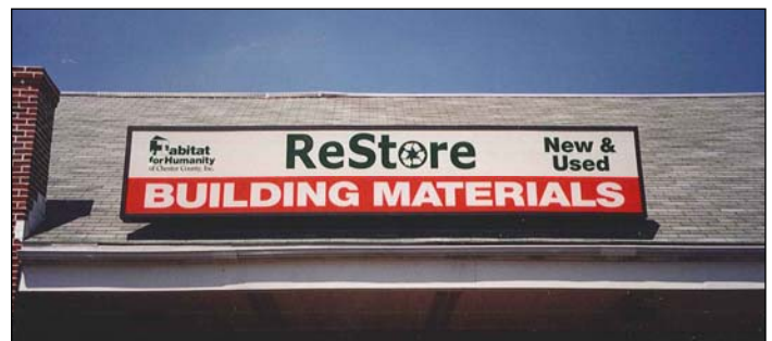
The original ReStore sign at opening in 2002

Register online today for this family favorite event! You will not want to miss the great raffles, prizes, food, and fun! Visit www.hfhcc.org for details and to register.