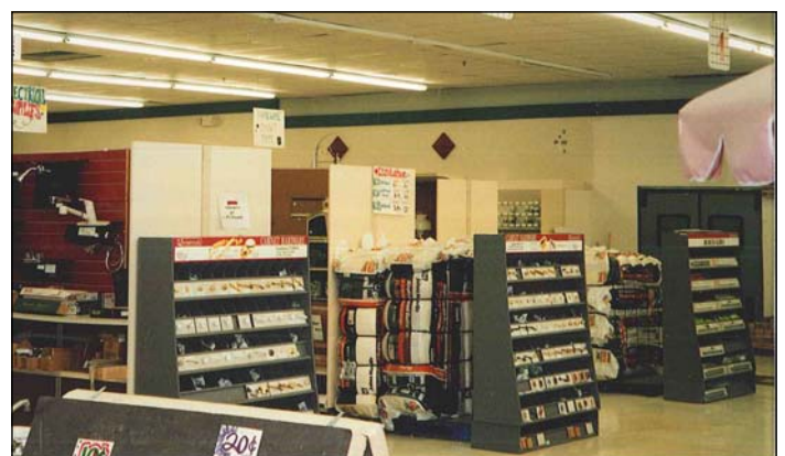
A glimpse of the Caln ReStore before its grand opening